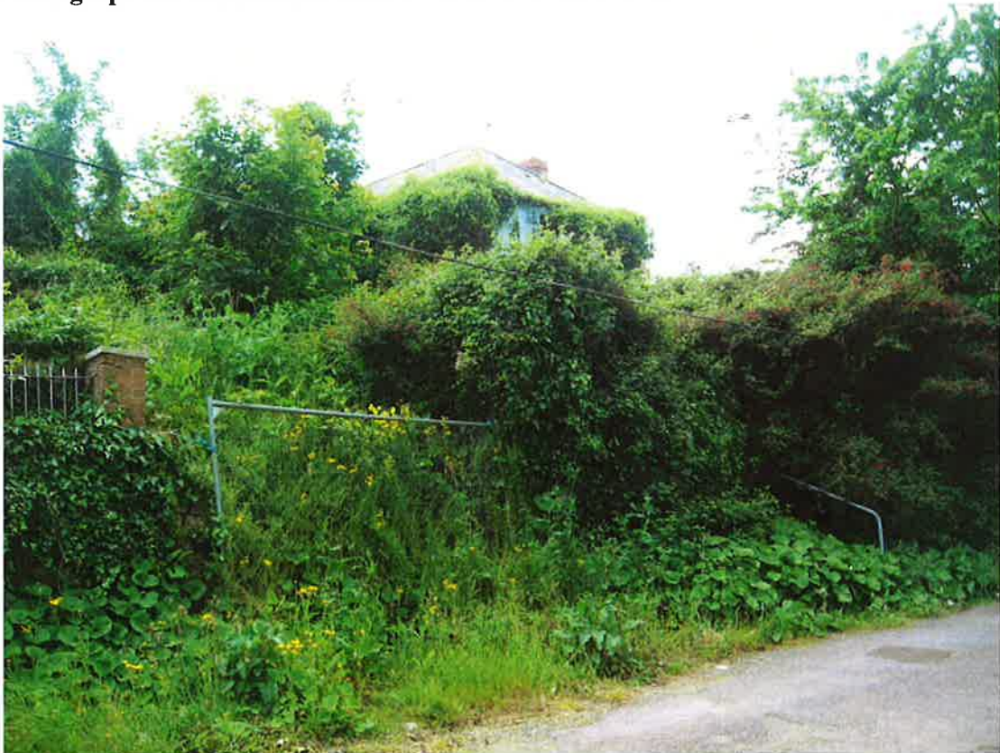
Photograph 1.1 –Date Taken: 31.5.11 - View of front of house from public road