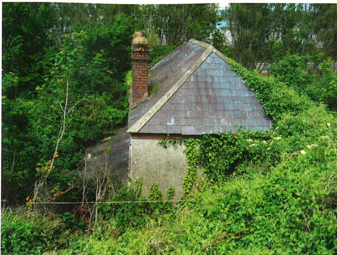
Photograph 1.5 –Date Taken: 31.5.11 - View of rear of house

Derelict site: Elm Lawn, Loughbeg, Ringaskiddy