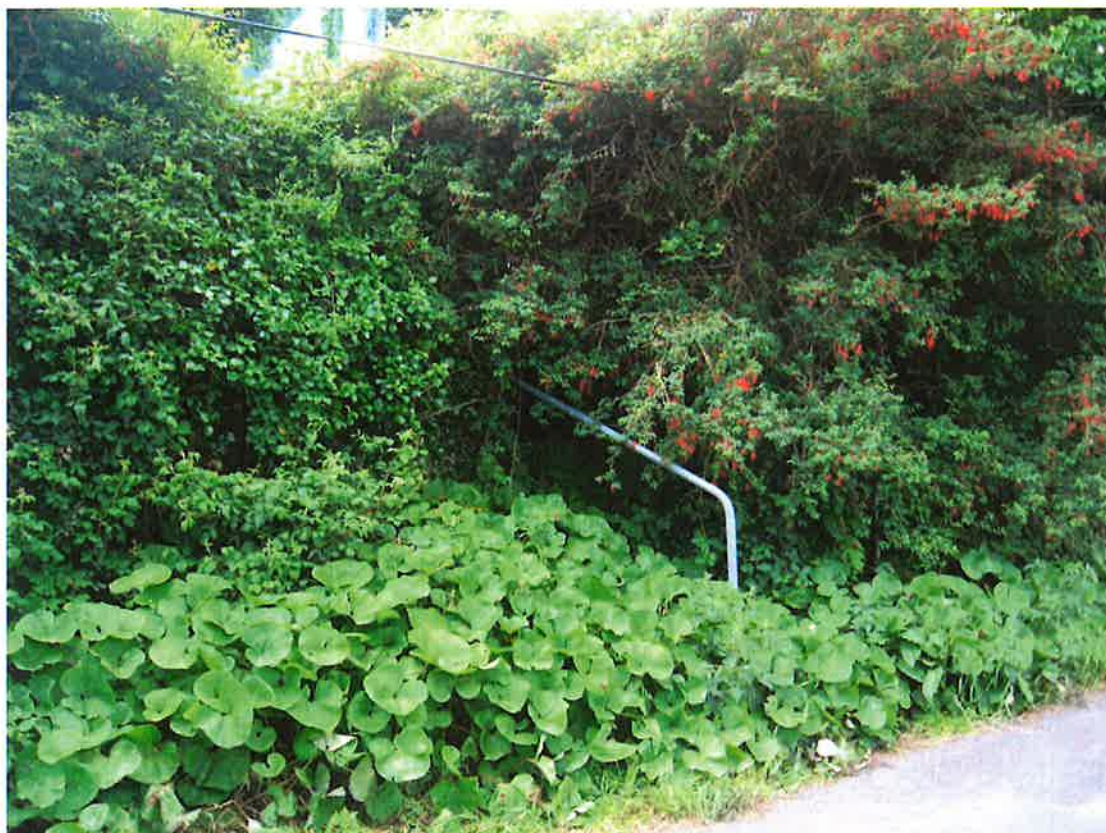
Photograph 1.3 –Date Taken: 31.5.11 - View of house entrance from public road