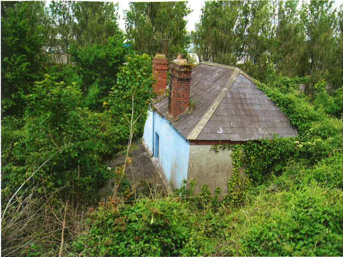
Photograph 1.0 –Date Taken: 31.5.11 - View of rear of house