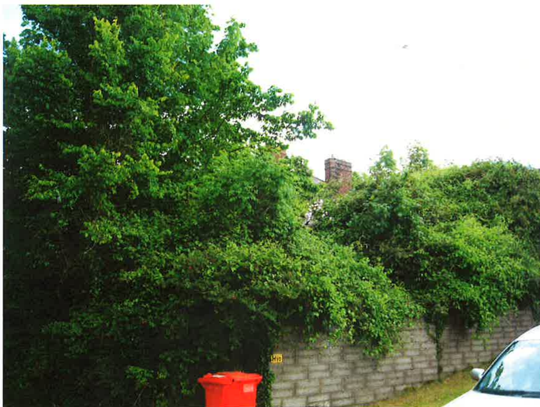
Photograph 1.4 –Date Taken: 31.5.11 - View of side of house from public road